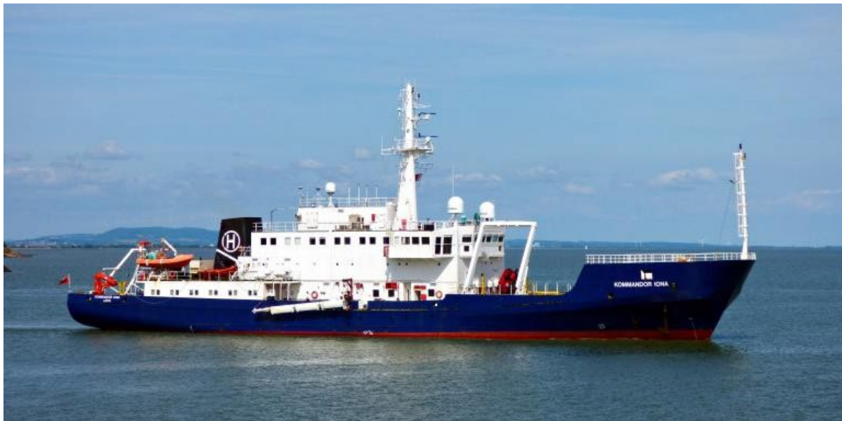
Figure 2. Kommandor Iona.

Survey activity will be undertaken by Fugro using the Kommandor Iona and the Fugro Pioneer.