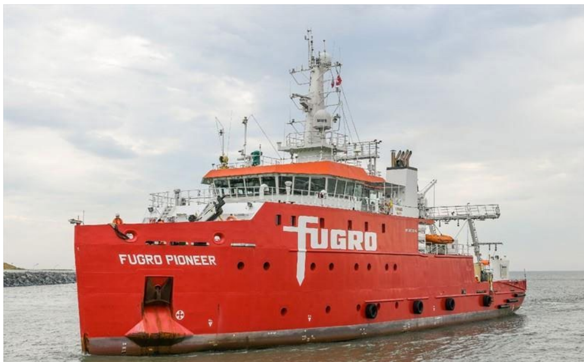
Figure 3. Fugro Pioneer.