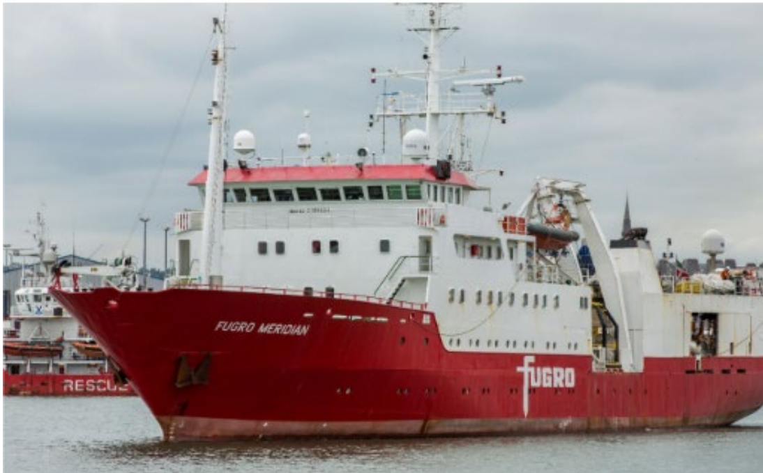
Figure 2: Fugro Meridian

Survey activities will be undertaken by Fugro using the Fugro Meridian and the Fugro Revelation.