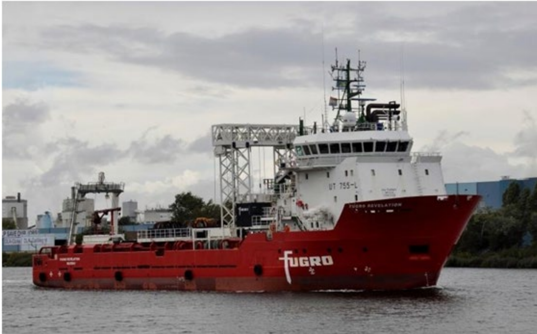
Figure 3: Fugro Revelation