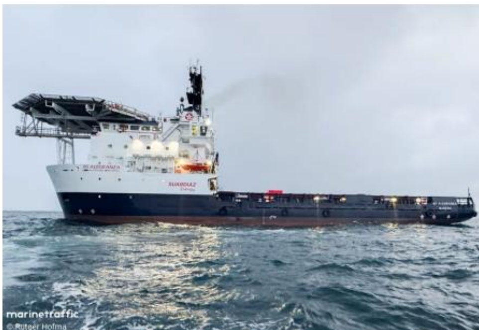
Figure 3: RS Aleganza