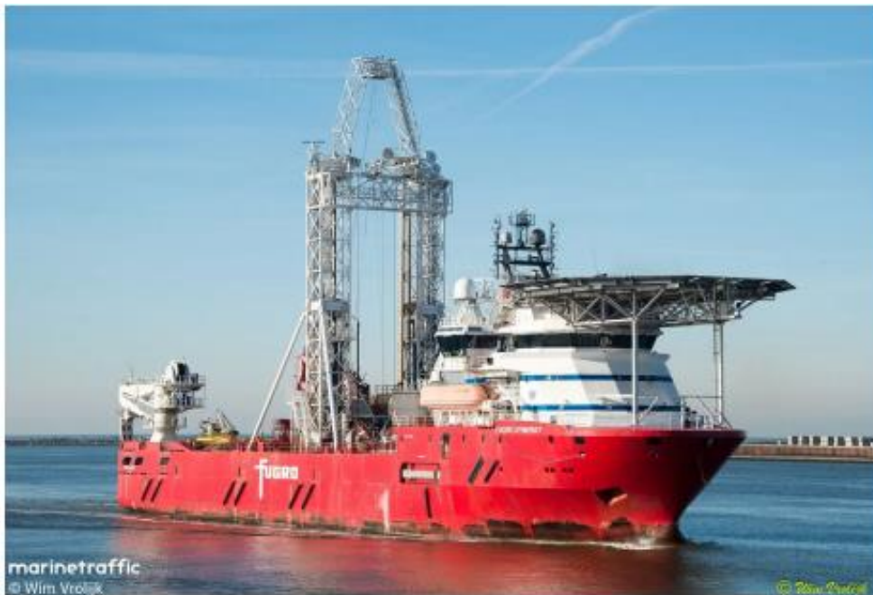
Figure 2: Fugro Synergy

Survey activities will be undertaken by Fugro using the Fugro Revelation.