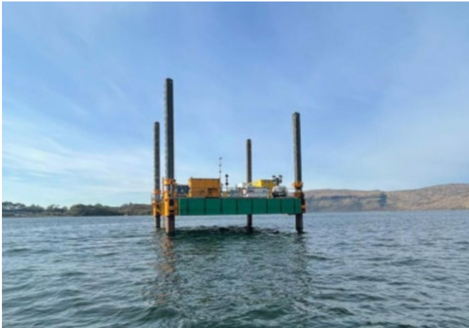
Figure 4. OCM 81

The geotechnical survey in the nearshore area will be undertaken by Causeway using the OCM 81, a JUB. A Multicat, the Morag M, remain in Berth in Buckie and will be used to assist the OCM 81 for all barge moves as required.