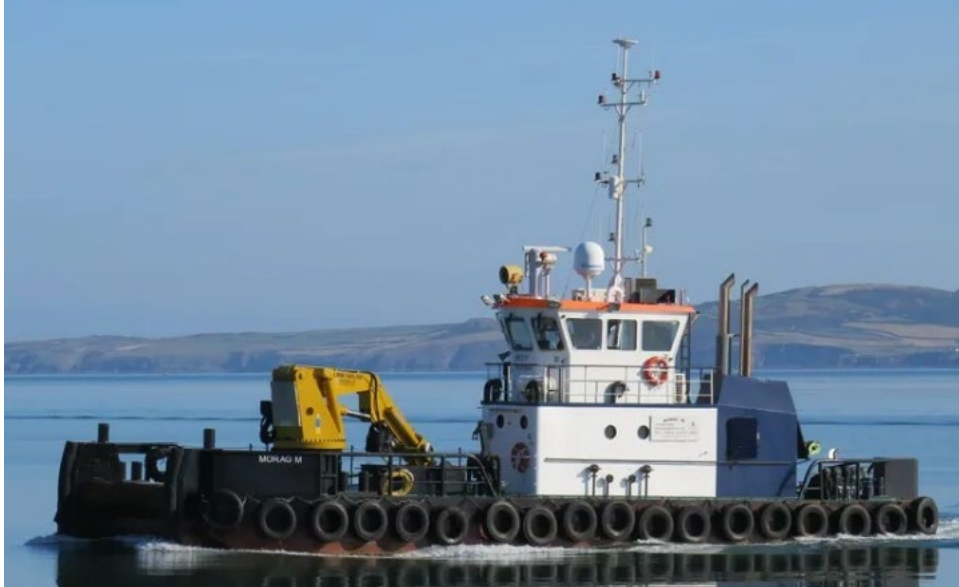
Figure 5. Morag M