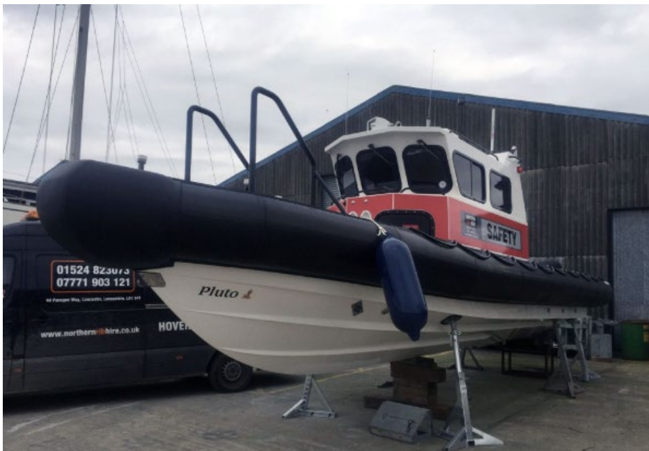
Figure 6. Pluto

A Crew Transfer Vessel (CTV), the Pluto, will be transiting from Whitehills daily.